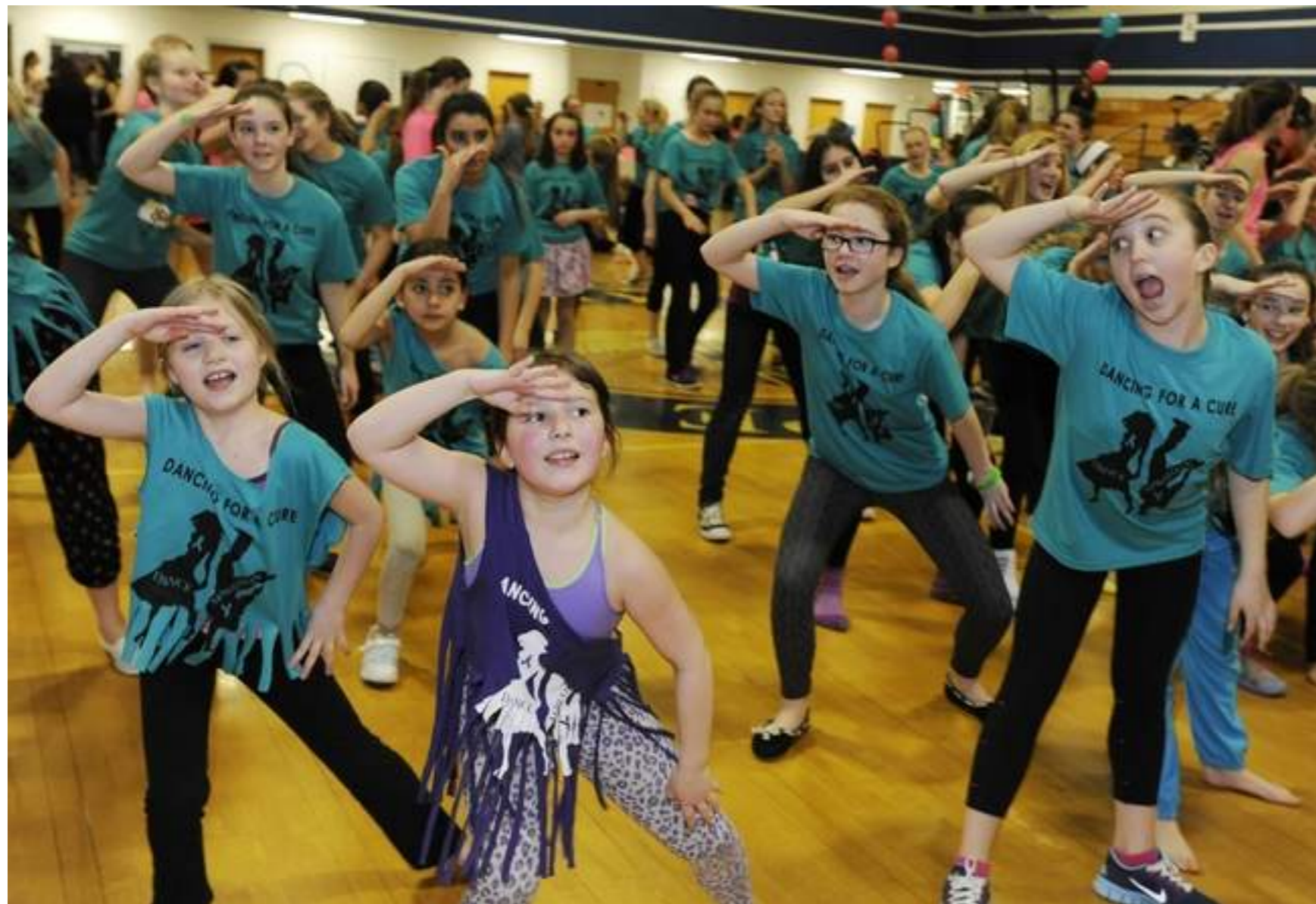
Young dancers took the floor last year for the annual Dancing for a Cure Dance Marathon. The four-hour event for all ages takes place Saturday night.