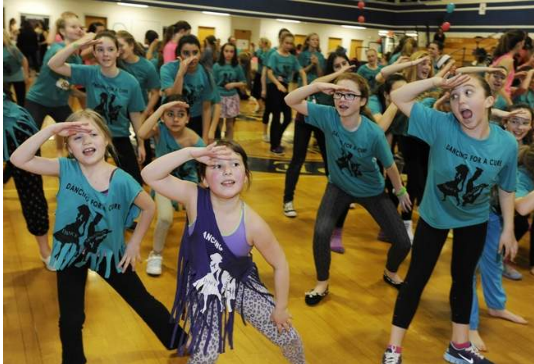
Young dancers took the floor last year for the annual Dancing for a Cure Dance Marathon. The four-hour event for all ages takes place Saturday night.